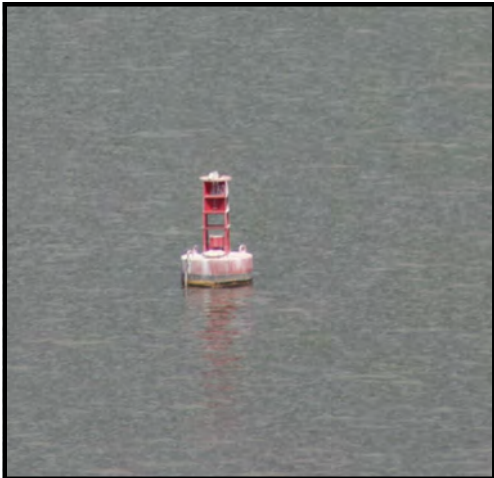
Mid channel buoy.