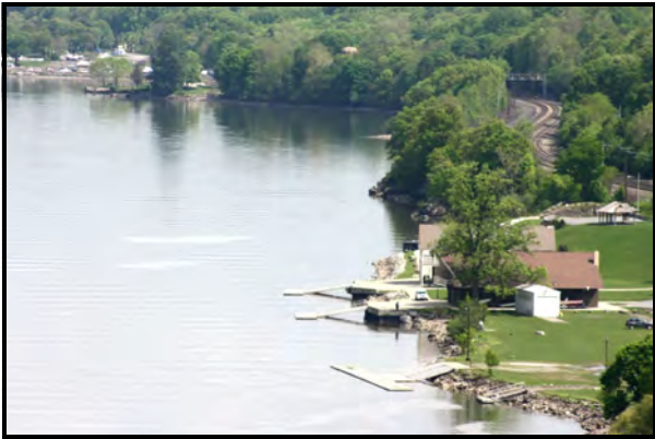
Eastern shore looking north.