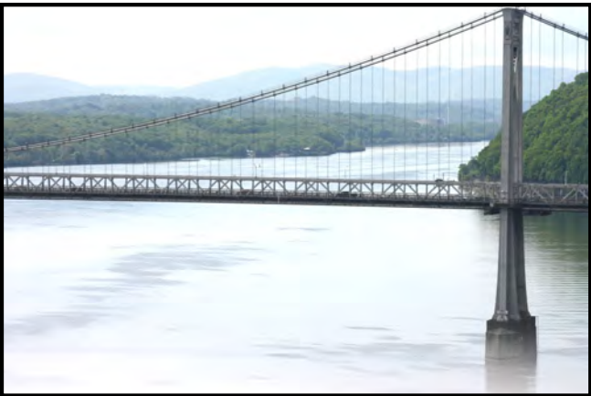
View from the walkway of the Mid-Hudson Bridge.