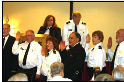
Swearing in of the D/2 Bridge