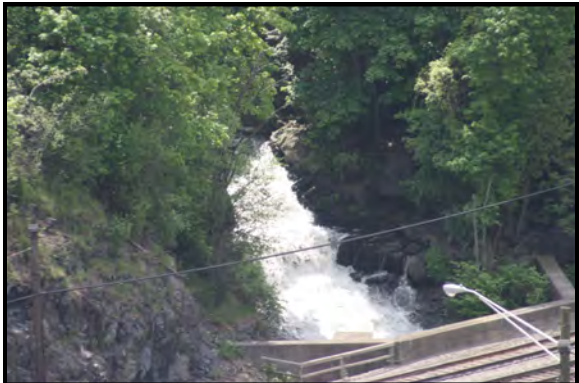
Water falls on Eastern shore.