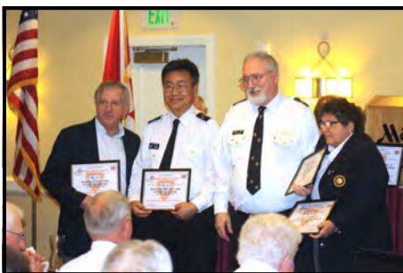
Winners of VSC awards. From l to r, Peekskill, Westchester, Sacandaga And Sacandaga.