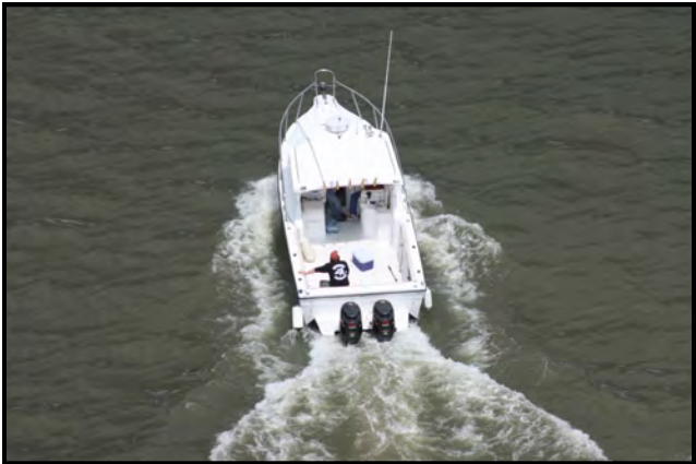
Boat heading North, just passed under the Walkway.